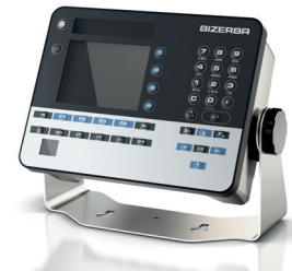
iS30 weighing terminal