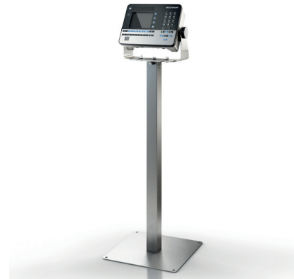
iS30 weighing terminal with column

With the large fully graphic display the operator sees all important process information at a glance. Product data can be quickly viewed and edited. Thanks to an alphanumeric keyboard data can be effectively entered or deleted. Large keys with mechanical pressure point allow operation with gloves. An acoustic signal confirms an input. Thanks to powerful electronics of the terminal, weight values can be quickly established and data directly transferred to higher ranking systems. Up to two weighing modules may be connected for even more flexibility.