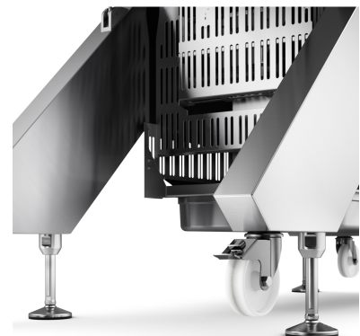
Hygienic design of A660

Customized solutions are developed and implemented by the Customer Solution Center